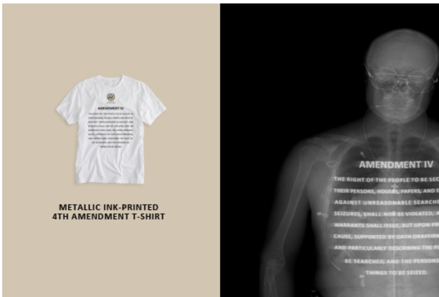
METALLIC INK-PRINTED 4TH AMENDMENT T-SHIRT